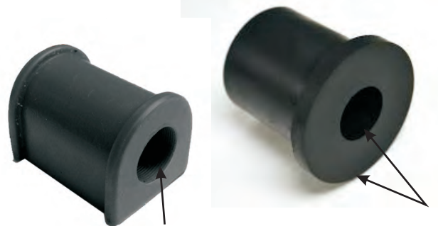
Grease bushing face and ID only