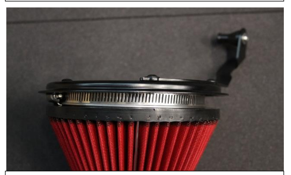
8. Ensure the clamp is at the base of the filter neck – if not, slightly loosen and pull it down, then tighten.