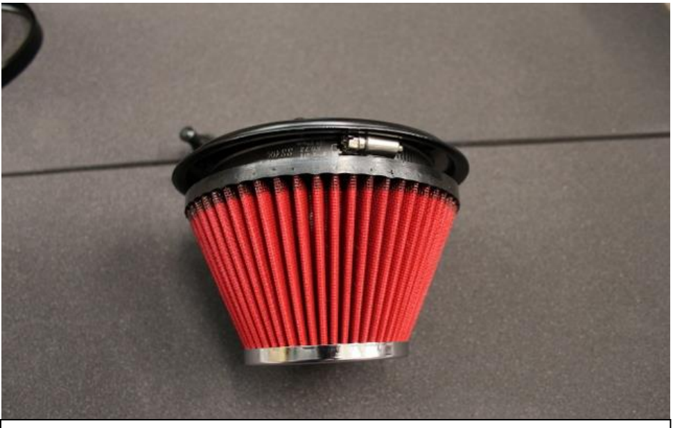
5. Remove the filter from the cowl by loosening the filter clamp as shown.