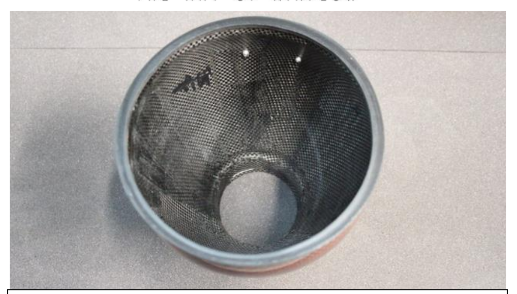
9. Place the rubber gasket on the carbon housing edge.