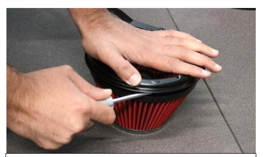
7. Now push the cowl back into the new filter. Push the cowl down fully and tighten the clamp around the filter – apply downwards pressure on the cowl while you tighten.