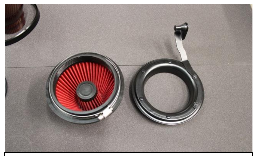
6. With the clamp loosened you can pull the cowl off the filter. It may require a little force.