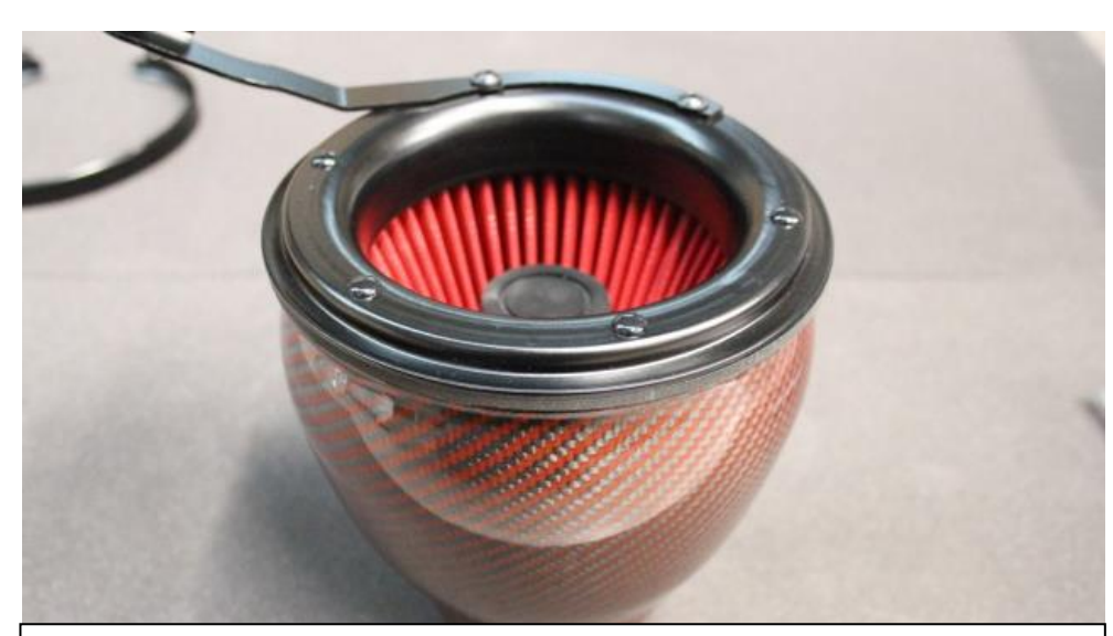
10. Insert the filter assembly back into the carbon housing – be careful not to catch the gasket as you push it down. Ensure gasket is even all around. Now rotate the bracket to the SAME position as it was originally.