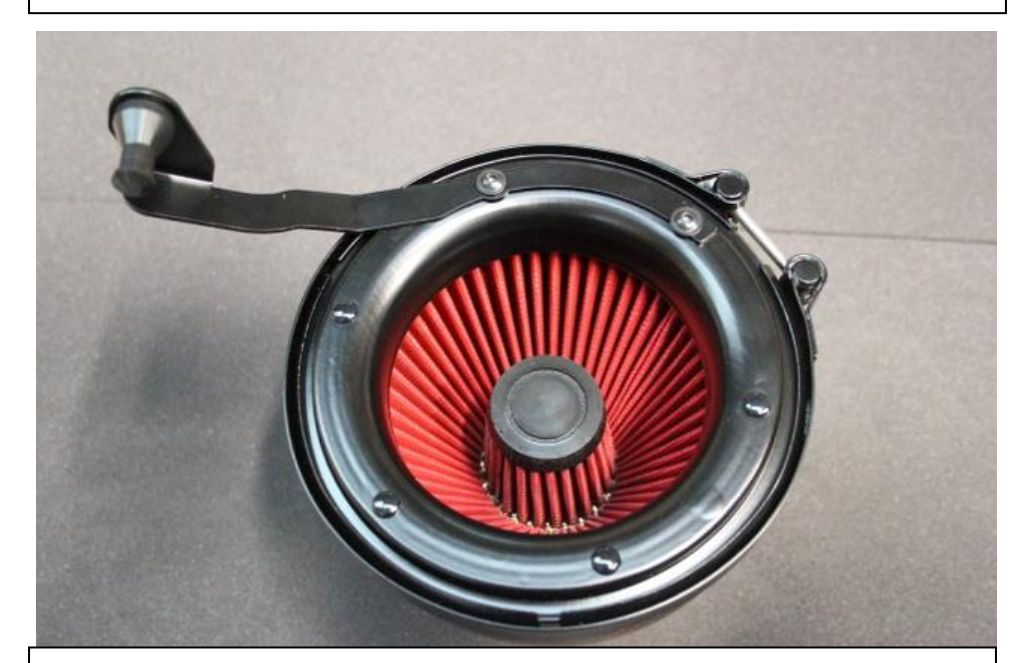
11. Place the clamp back around the cowl – position clamp to the same position as originally and tighten